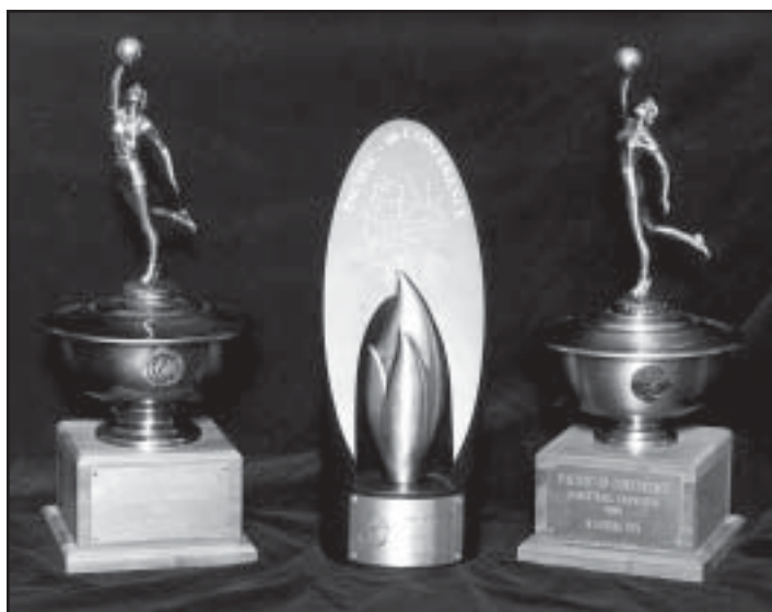
Washington has won three league championships since the Pac-10 started sponsorship of women's basketball in 1986-87. The Huskies took home the trophies for the 1987-88, 1989-90 and 2000-01 seasons.